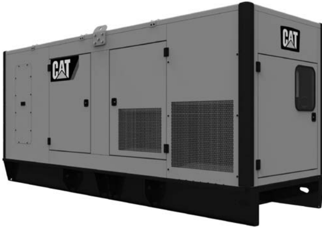
Picture shown may not reflect actual package.