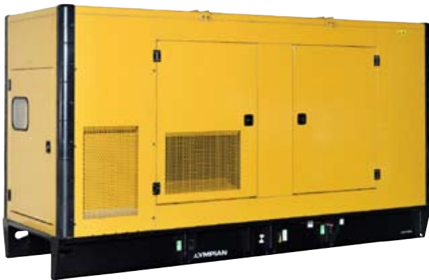
Enclosure pictured may include optional accessories.