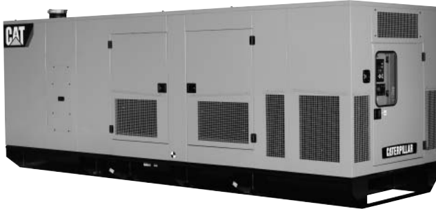
Picture shown may not reflect actual package